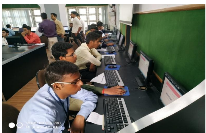
Online Technical & IQ Test