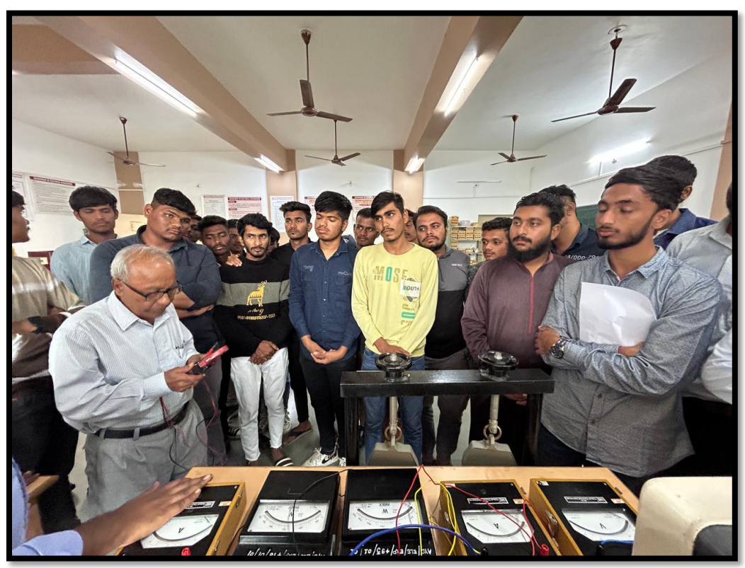
Practical session in Electrical Machine lab