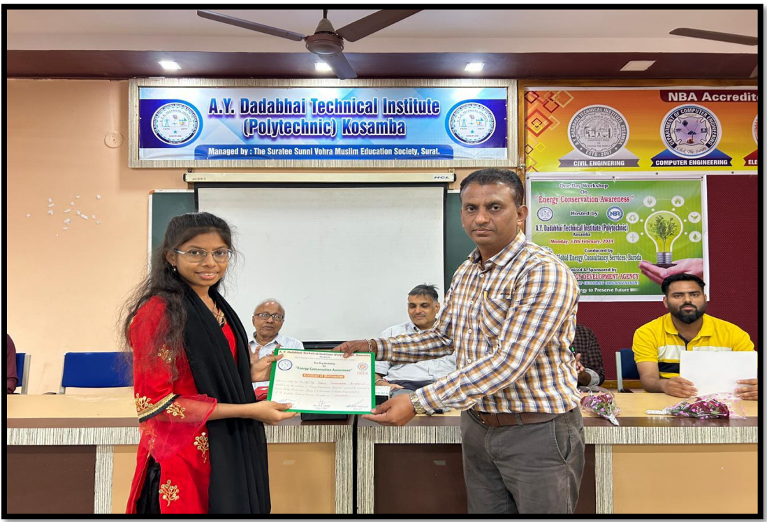
Certificate distribution to student