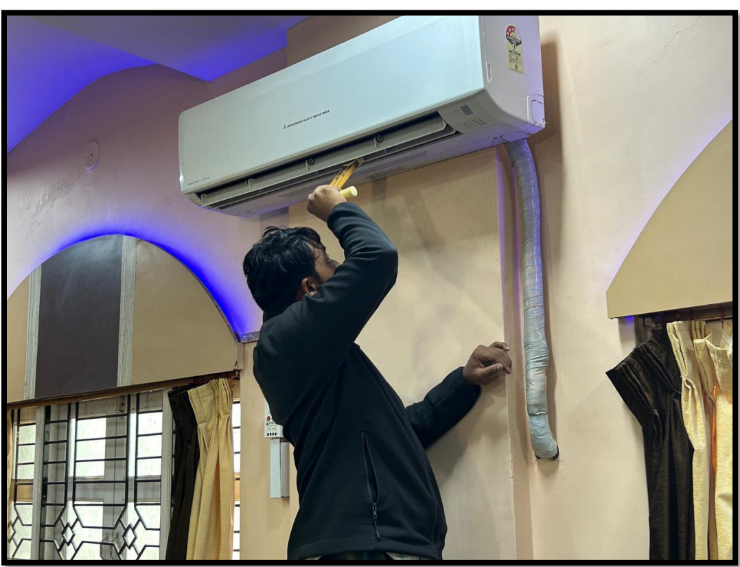
Practical session to measure EER of aircondition