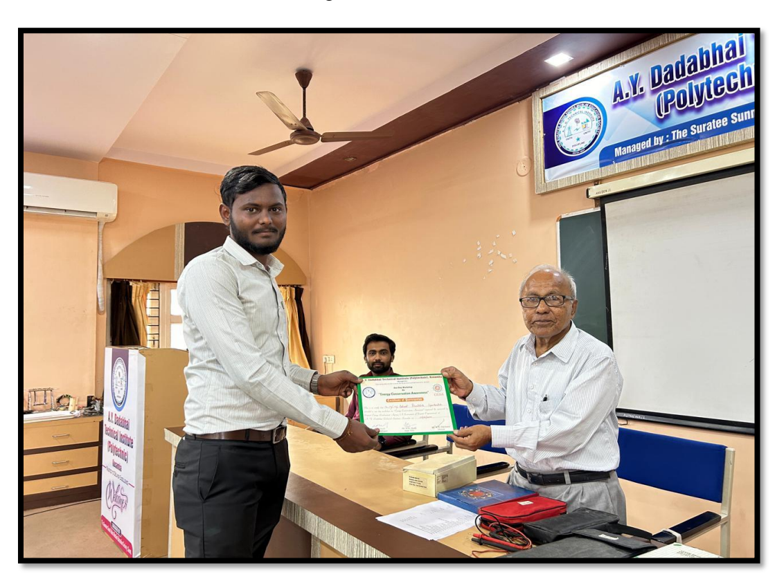
Certificate Distribution to students