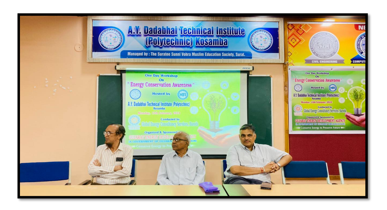
Dignitaries on the Dias