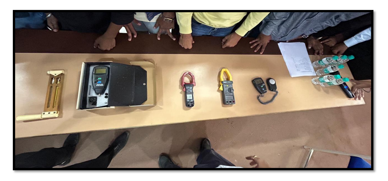
Explanation of instrument used in Energy Audit