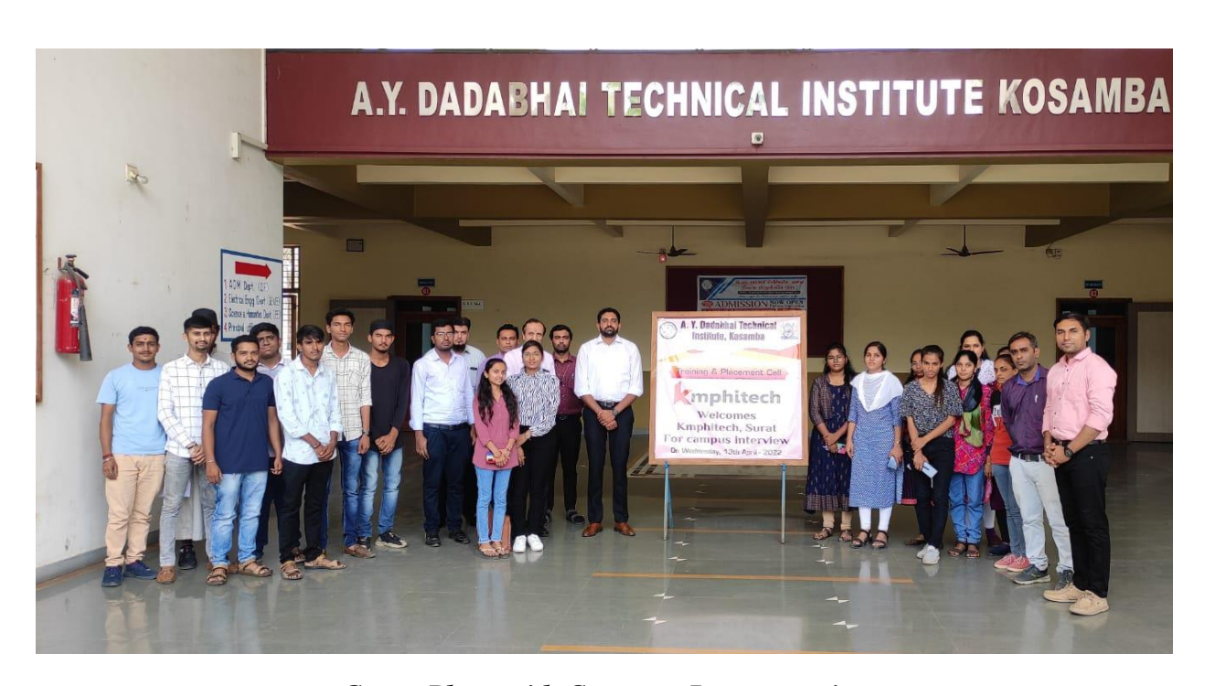
Group Photo with Company Representative