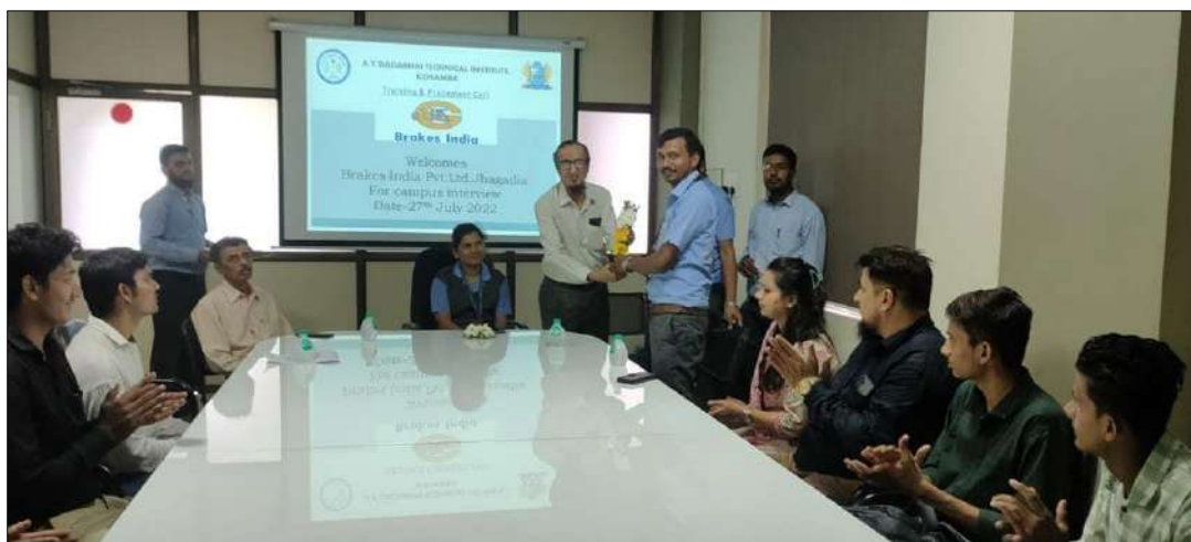
Board Room for Campus Interview