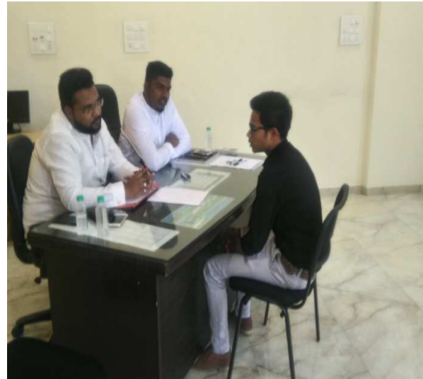
Moments of Interview