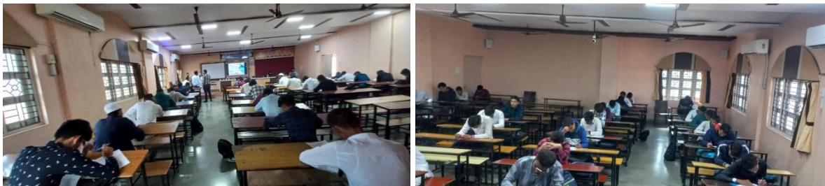
Aptitude And Technical Test

The selection process began with an aptitude and technical test designed to assess the analytical, problem-solving, and technical abilities of the candidates. This initial screening stage was crucial in identifying the most promising candidates from the pool of participants.