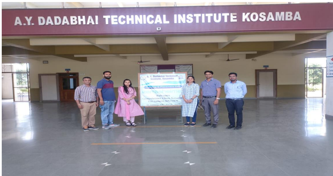
Group Photo with Company Representative