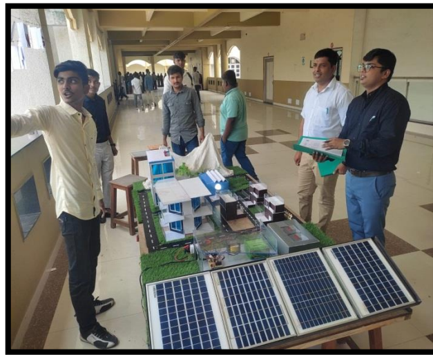
Computer Engineering Project Evaluation By Jury