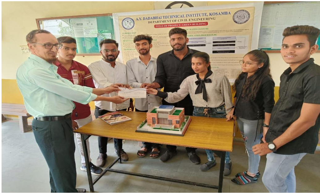
Civil Engineering winner awarded with cash Prize by Director