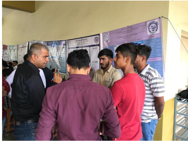
Mechanical Engineering Project Evaluation by Jury