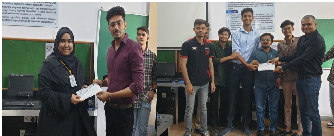
Computer engineering winners Awarded with Cash Prize by Jury