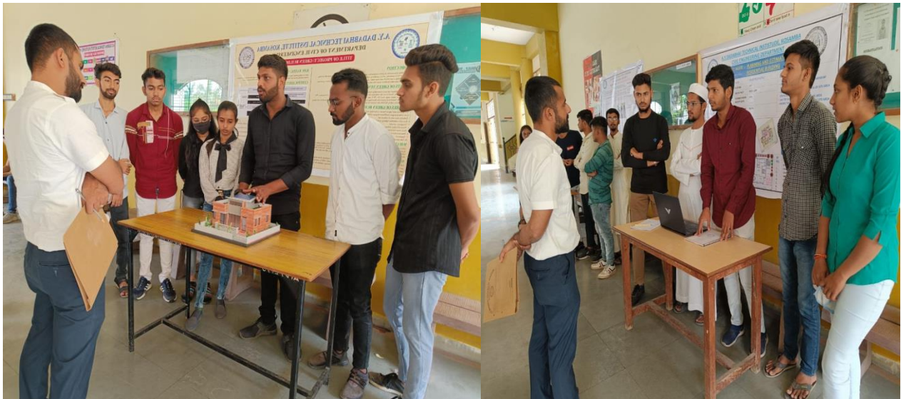
Civil Engineering Project Evaluation by Jury