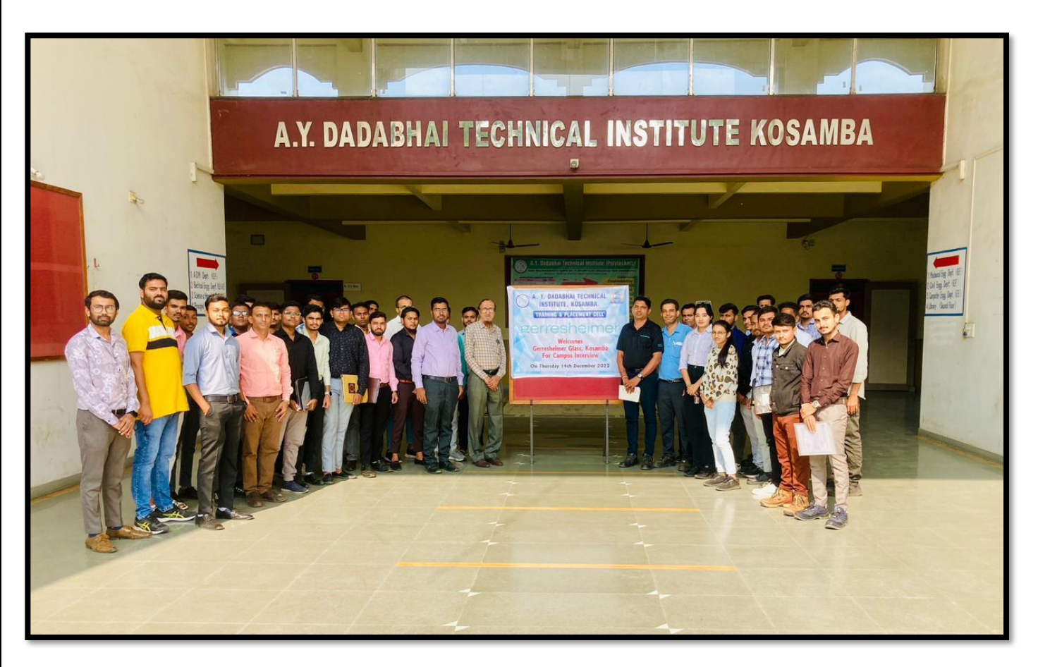
Group Photo with Company Representative